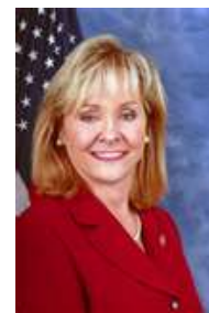
Rep. Mary Fallin